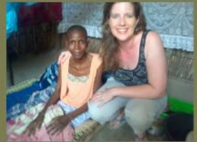
We give food to this woman