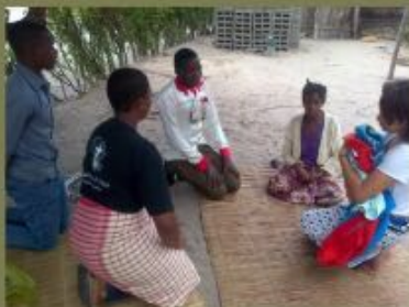
Visiting The Sick