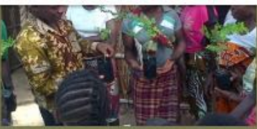
Distributing Moringa Plants