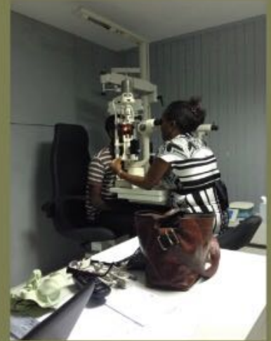
Paid for Eye Exams