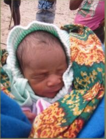
Baby we provide Formula