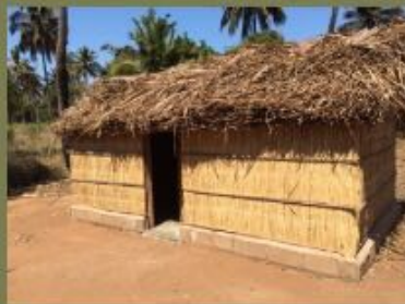
House Built In A Village