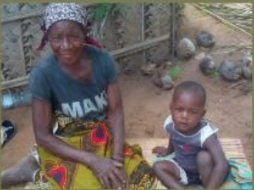
A Grandmother and Orphan we give food packets