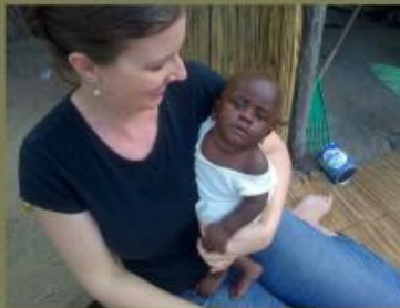
A baby we provide formula