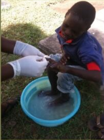
Providing Basic First Aid