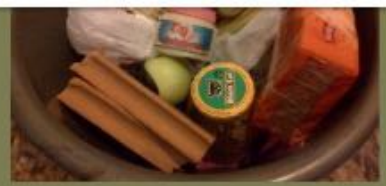
Sample Food Packet