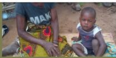
Grandmother caring for her grandchildren